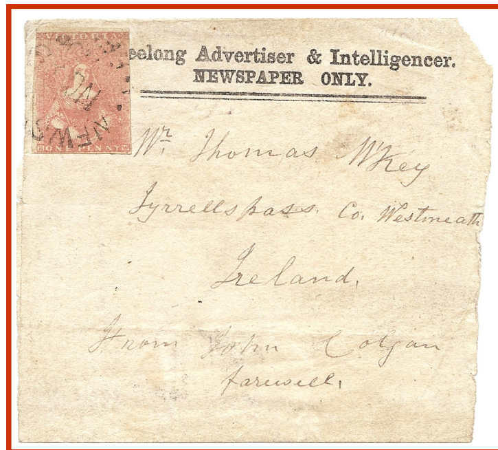
Geelong, 20 November 1855

Three Victorian wrappers from this decade are recorded