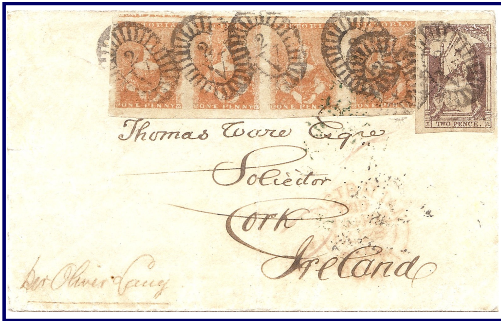
Geelong, 20 August 1855