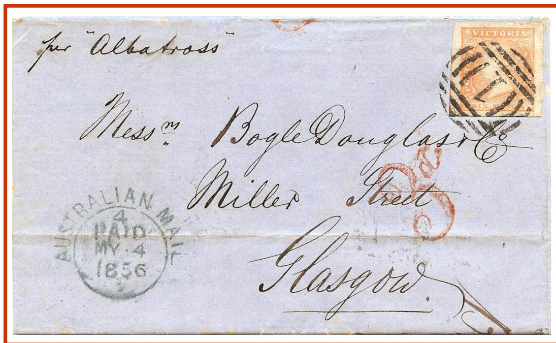
Melbourne, 16 January 1856