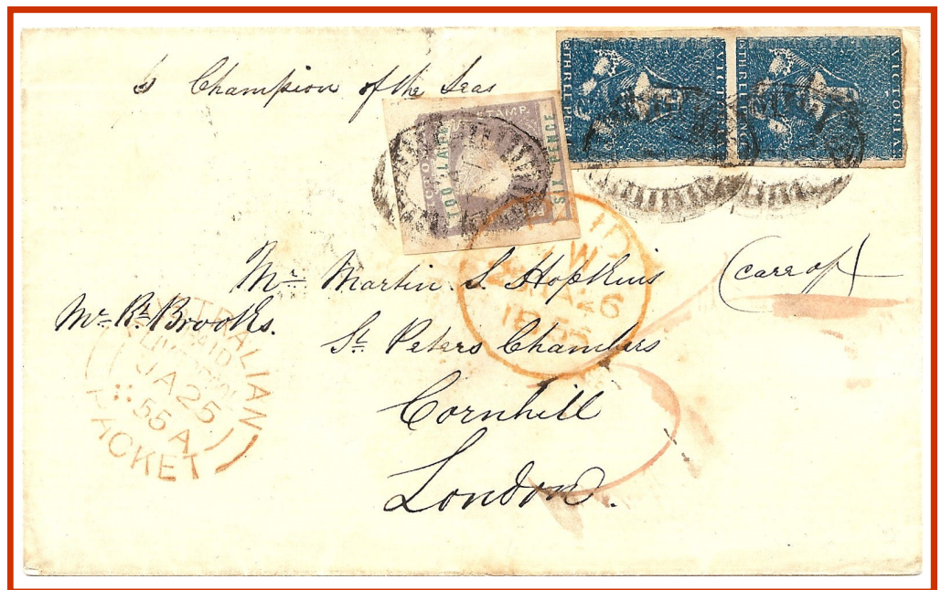
Melbourne, 26 October 1855

Finest of 8 foreign-mail covers bearing the world's first TOO LATE stamp