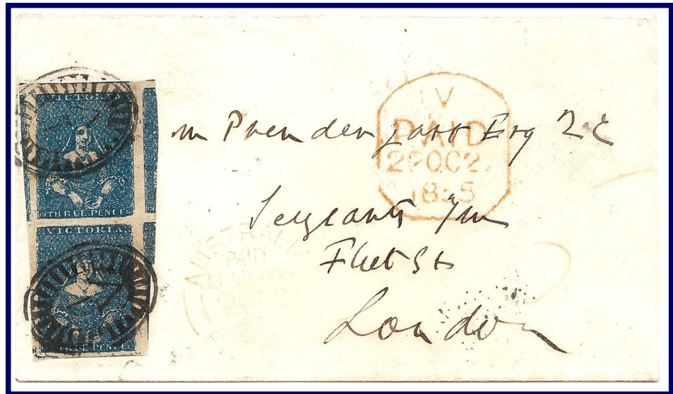
Melbourne, 21 July 1855