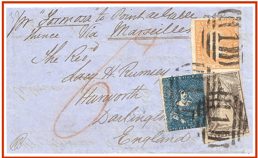
Melbourne 28 July 1856

The only Victorian cover paying the 11 d rate