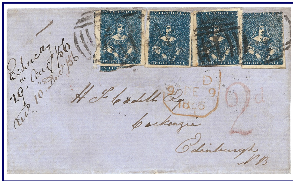
Echuca, 29 August 1856