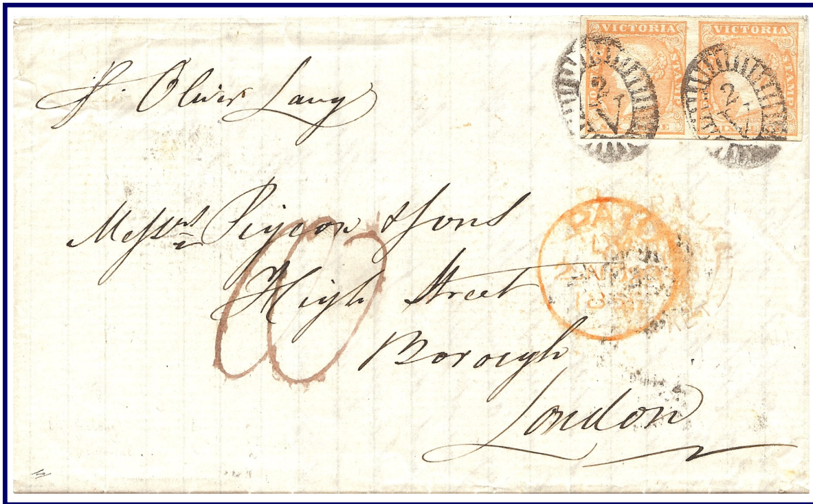
Geelong, 21 August 1855

Paid 1/- double uniform rate, Melbourne 10 d credit to U.K. Black Ball Oliver Lang , Melbourne 23 August, Queenstown Ireland 26 November Liverpool marked paid on 28 November, London the same day 97 days