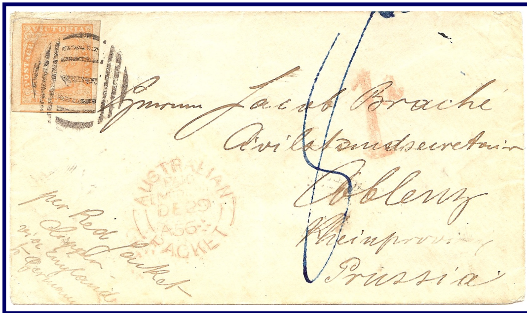
Melbourne, 27 September 1856

Paid only to the U.K., 6 d uniform rate, Melbourne 1 d credit to U.K.