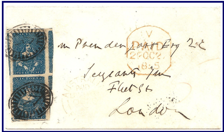
Melbourne, 21 July 1855