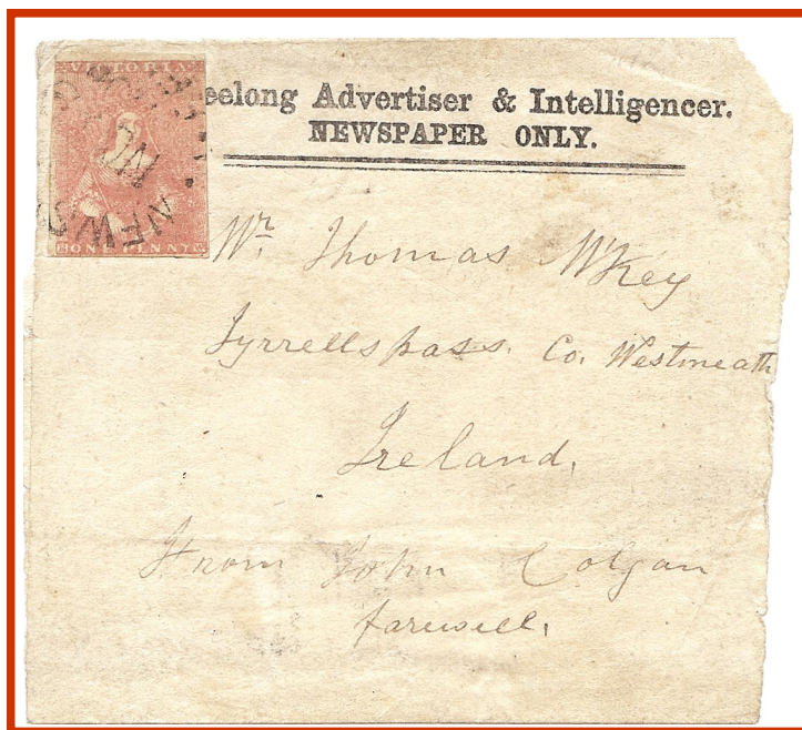
Geelong, 20 November 1855

Paid 1 d newspaper rate to Melbourne; No postage for conveyance to U.K.