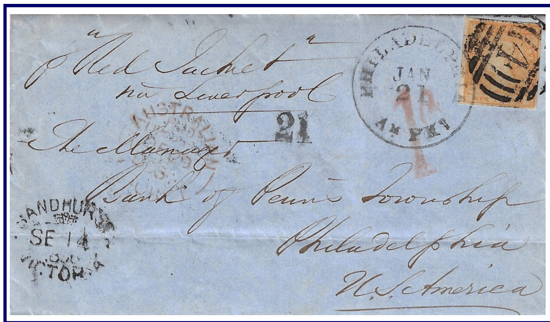
Sandhurst, 14 September 1856

When adverse winds prevented landing at Liverpool, ships were required by law to land the mails at the nearest port, from where mail bags were then conveyed overland to London.