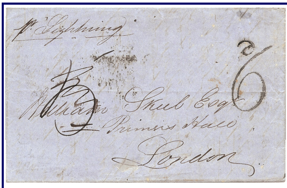
Geelong, 26 August 1856

Prepayment was not required until 1 January 1857