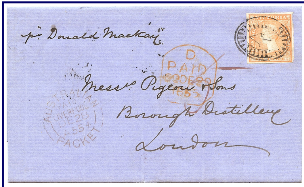
Melbourne, 29 September 1855