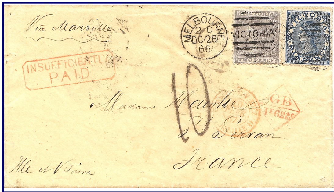
Geelong, 28 December 1866

Paid 8d, 2d underpayment for the 10d rate, so treated as unpaid Geelong, Melbourne 28 December, Galle 17 January Candia, 18 January, Suez 31 January; Ceylon , Alexandria 3 February, Marseille 9 February Marseille 10 dec. due Received 12 February 47 days