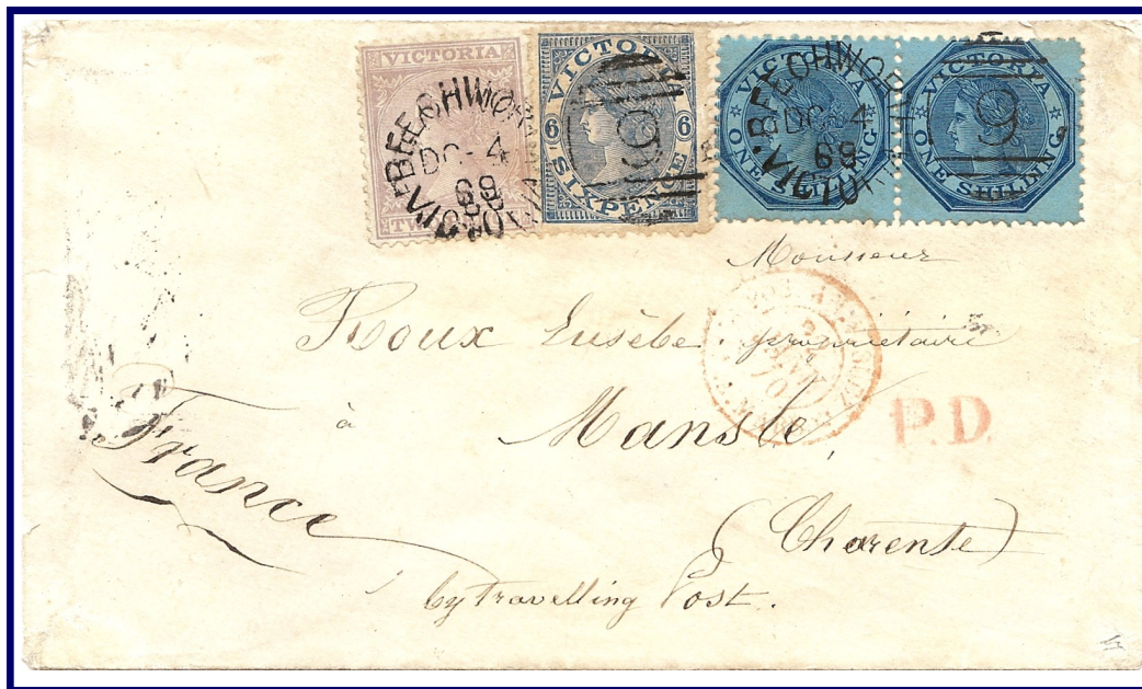
Beechwood, 4 December 1869

Quadruple rate to France, paid to destination