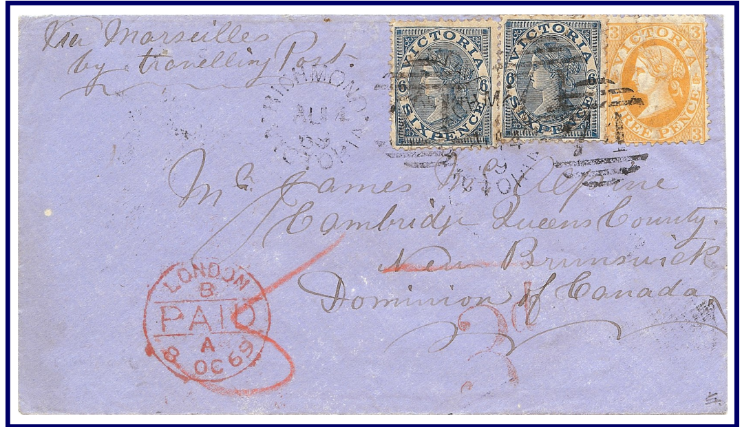
Richmond, 4 August 1869

Quadruple rate to France, paid to destination