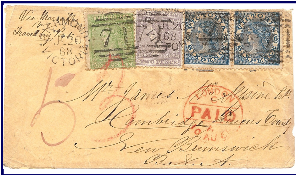
Richmond, 20 June 1868

To New Brunswick via Canadian Packet from Liverpool