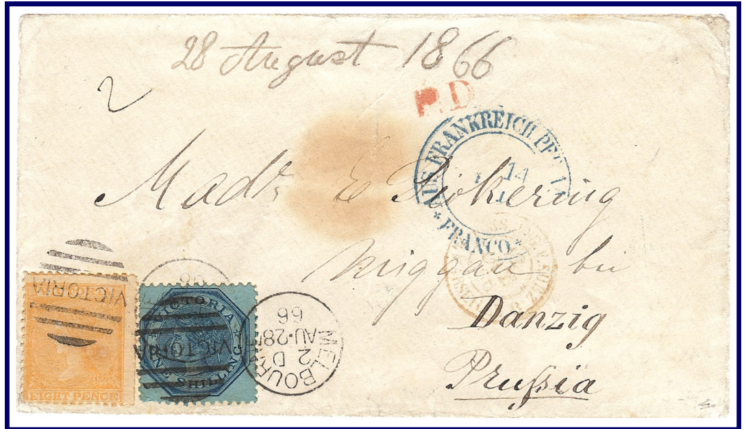
Melbourne, 28 August 1866

To New Brunswick via Canadian Packet from Liverpool