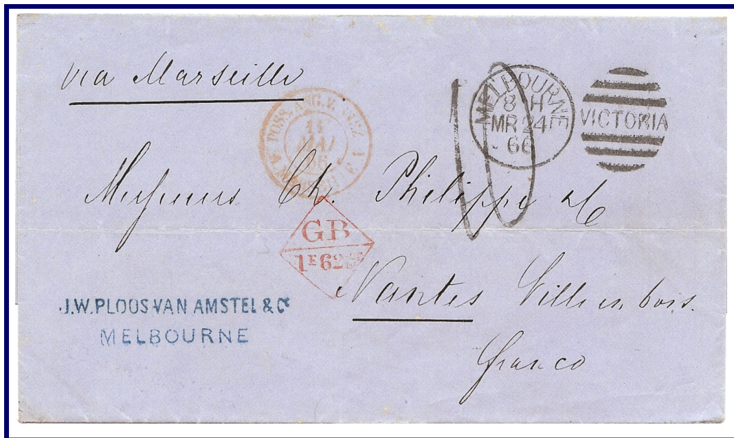
Melbourne, 24 March 1866