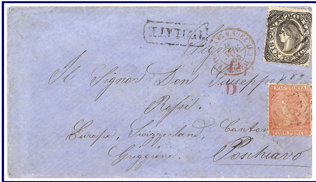
Clunes, 23 September 1865