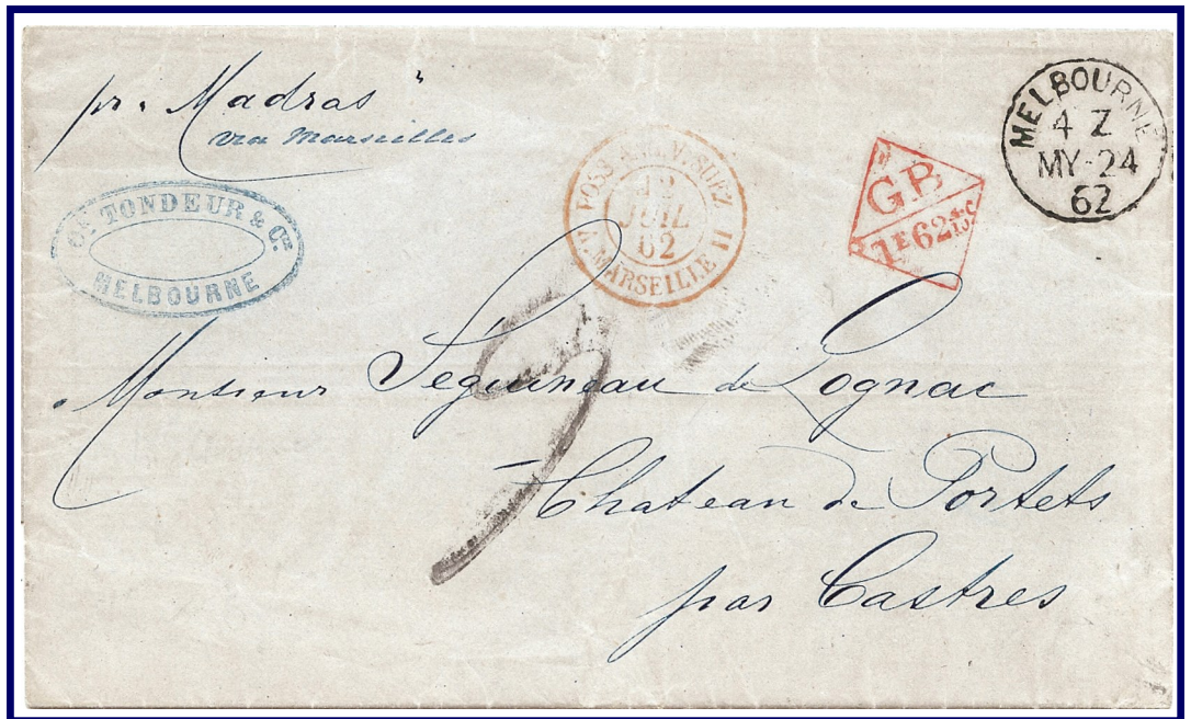
Melbourne, 24 May 1862