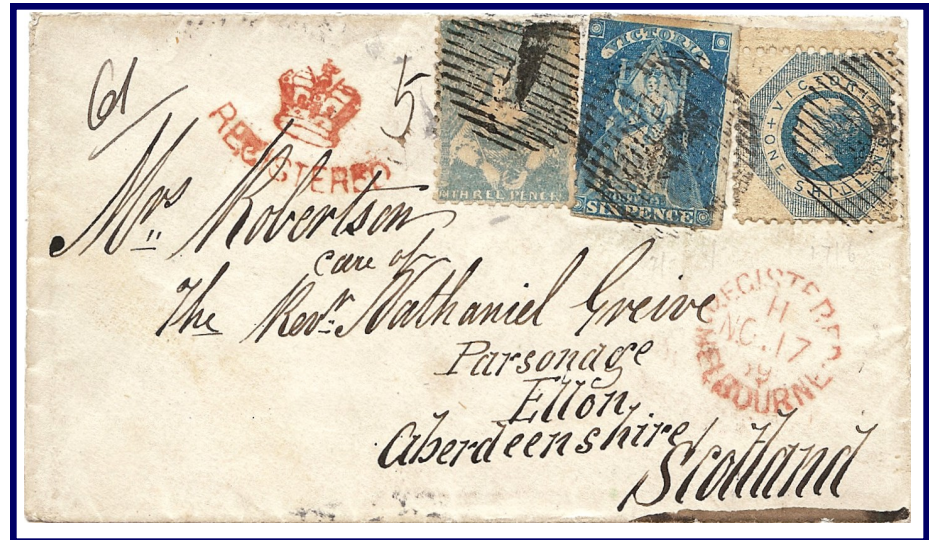
Melbourne, 17 November 1859