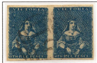
[7-8] Horsham 51