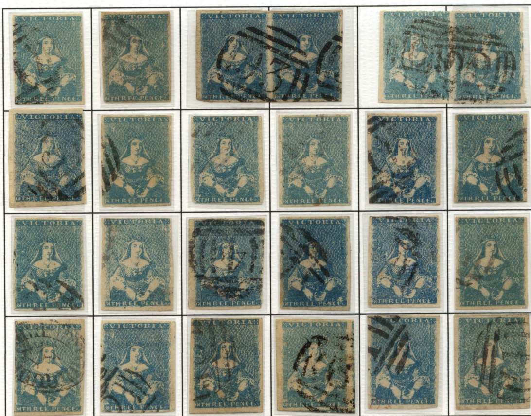
Reconstruction of the intermediate stone of 24 subjects used to create a printing stone of 320 impressions in two panes of 160.