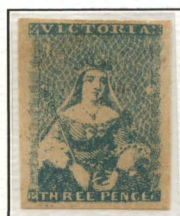
[8] Ex Perry