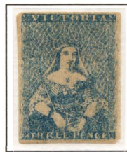
[1] Ex Perry