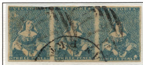
[14-15-16] Creswick 7 Ex Perry