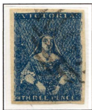
Group A [2]

There are three sets of coloured lines varieties covering eight units on the printing stone. There are two schools of thought on the nature of these coloured lines, however, it is generally accepted that the cause may be the remains of an imperfectly erased design on the printing stone.