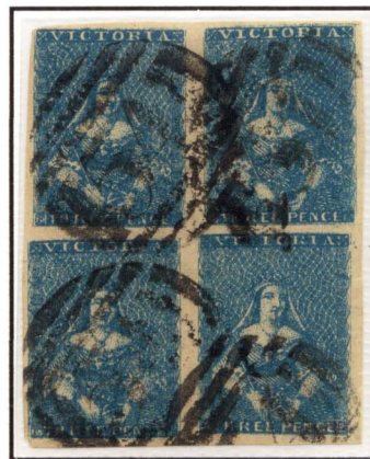
[16-17/22-23] Kilmore 54 This block is the third largest multiple known and the only recorded block of four Ex Boker, Perry