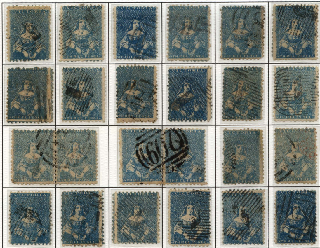
Reconstruction of the intermediate stone of 24 subjects used to create a printing stone of 320 impressions in two panes of 160.