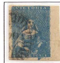
[12] Ex Perry