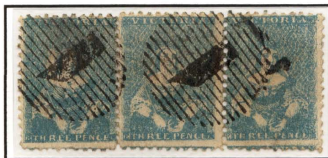
[1-2-3] Melbourne 1 Strips of three are the largest multiple known and two are recorded