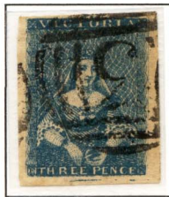
[19] Castlemaine 3