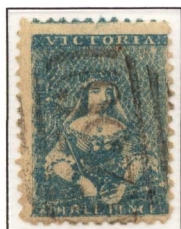
[19] Morrison's 266 Ex Wawn, Perry

Printed in shades of Greenish Blue Perforated in early 1859