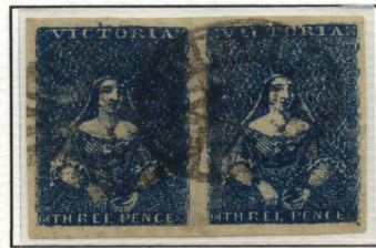
[5-6] Geelong 2