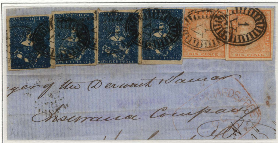
[21] [11] [22] [17] and 6d Woodblock x 2 Ex Seybold