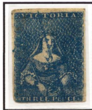
Group D [15] The only unused example recorded