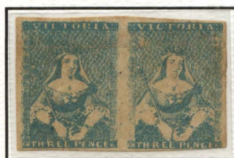
[14-15] Pairs are the largest known unused multiple and two are recorded