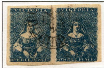
[14-15] Williamstown 3