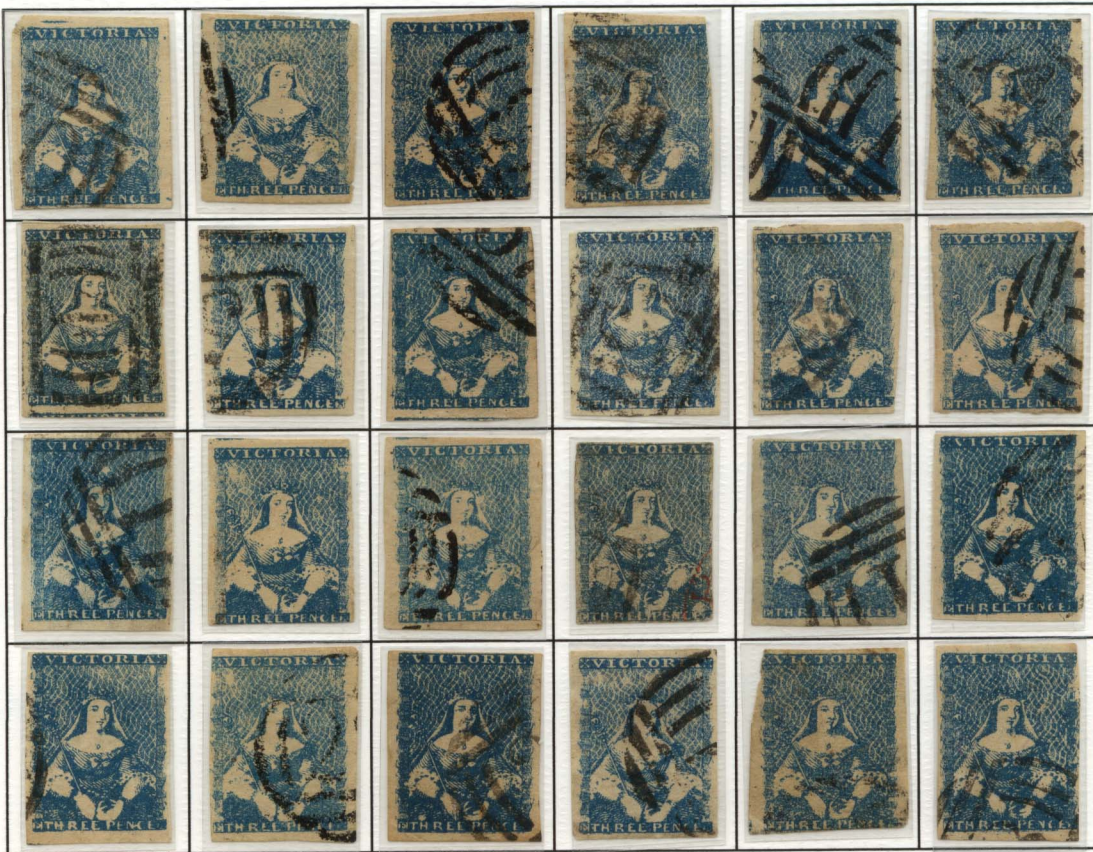
Reconstruction of the intermediate stone of 24 subjects used to create a printing stone of 200 impressions in a single pane.