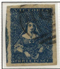
[23] Castlemaine 3