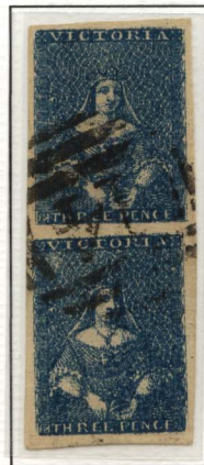
[16/22] Avoca 14 Ex Boker, Perry