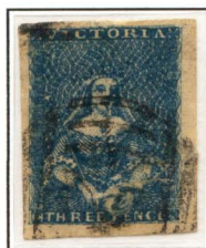
Group B [2]