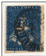
Group E [20]