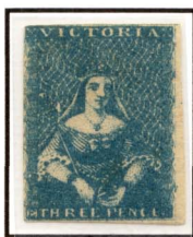
[17] The only recorded unused example Ex Harvey, Perry