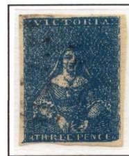
Unknown Group [15]