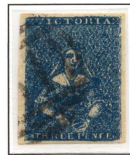
Group A [15]