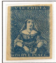
[19] Ex Perry