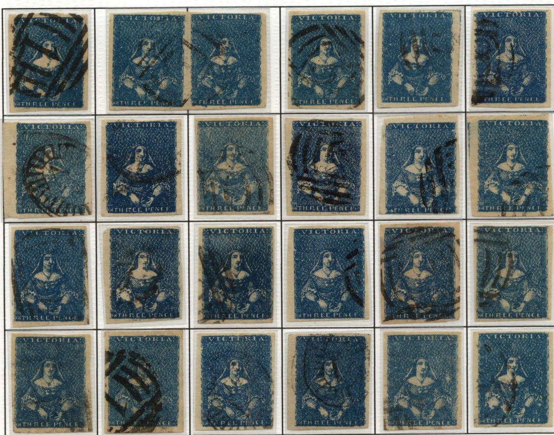
Reconstruction of the intermediate stone of 24 subjects used to create a printing stone of 400 impressions in two panes of 200 (ten rows of twenty).