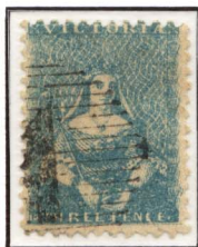
[17] Melbourne 1 Two examples are recorded of the Type 17 retouch

It is estimated that approximately two dozen examples of this printing are recorded.