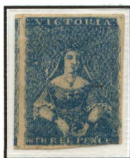
[17] The only recorded unused example

Type 17 on the intermediate transfer was the only unit retouched, and this retouch is a primary characteristic appearing on every Type 17 unit on Printing Stone B. The retouching occurs under the "C" of "VICTORIA".