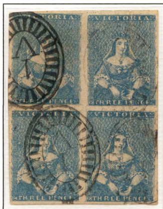
[17-18/23-24] Ex Boker

Type 17 on the intermediate transfer was the only unit retouched, and this retouch is a primary characteristic appearing on every Type 17 unit on Printing Stone A. The retouching occurs under the “C” of “VICTORIA”.