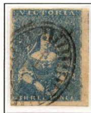
[17] Melbourne 1