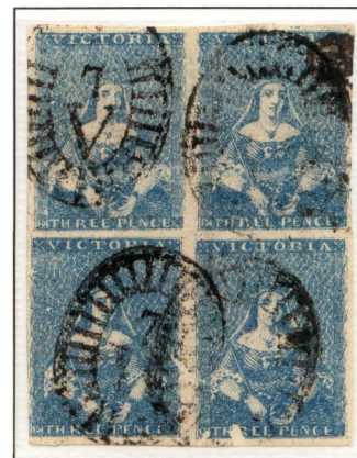
[17-18/23-24] Casterton 7 Ex Pack, Harris