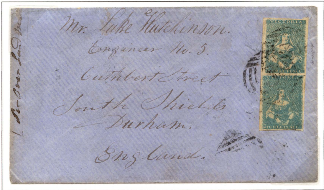
3d Greenish Blue [22/4], showing the intersection between two transfer groups, cancelled by Barred Numeral 3 on envelope from Castlemaine to England pre-paying the 6d ship letter rate.

On the reverse are datestamps for Castlemaine (4th December 1858); Melbourne (6th December 1858) and South Shields (12th February 1859).