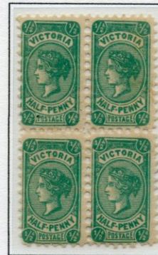
½d Blue green (Die I) Error – Watermark Upright

This error was listed by Stanley Gibbons in 1999.