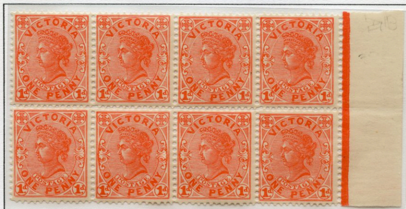
1d Rose Red

Victoria July 1905 Watermark Crown/A Perforation 12 x 12½