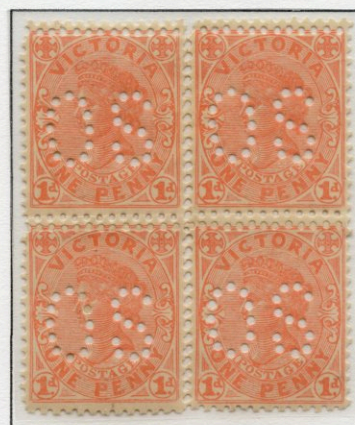
1d Pale Rose - (Perf. "OS")

This error was first reported in the Stanley Gibbons Monthly journal in September 1906 and listed in the Brusden White catalogue in 2004.