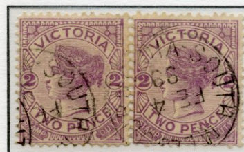
2d Violet Error – Watermark Sideways Facing Left

This error was first reported in “Ewans Weekly Stamp News” in January 1910 and listed by Stanley Gibbons in 2000. It is much scarcer than the 1899 printing. This is the only multiple recorded.