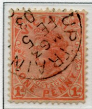
1d Dull Red (Die II) Error – Watermark Sideways Facing Right

This error was listed by Stanley Gibbons in 1999.