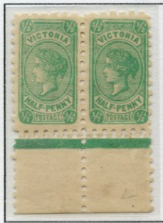
1/2d Blue Green Error – Double Perforation

There are no early reports in philatelic literature regarding this error and it was listed in the Brusden White catalogue in 2004.