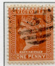
1d Brownish Orange Error – Double Perforation