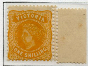
1/- Yellow Orange Error – Double Perforation

This error was first reported in “Philately from Australia” in March 1952 and listed by Stanley Gibbons in 2005. It is quite scarce, with most used examples known perforated “OS”. One mint copy is recorded.