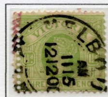
1½d Apple Green Error – Double Perforation

This error was first reported in the “Australian Stamp Monthly” in June 1938 and listed by Stanley Gibbons in 2005. This is the only multiple recorded.