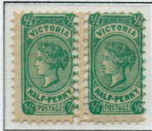
½d Blue green (Die I) Error – Double Perforations