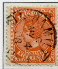
9d Pale Rose Error – Double Perforation

This error was first listed by Brusden White in 2004.