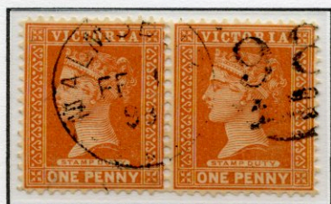
1d Brownish Orange Error – Watermark Sideways Facing Right