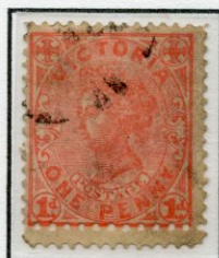
1d Dull Red (Die II) Mixed Perforations 12½ and 11 (E)

This error was first reported in “Philately from Australia” in March 1952 and listed by Stanley Gibbons in 2000. Mint blocks are scarce.