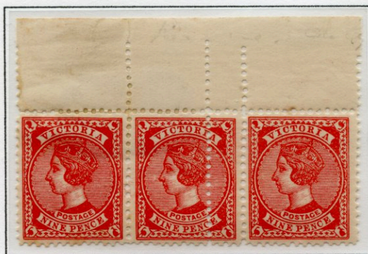
9d Rose Carmine Error – Double Perforations

1st August 1912 Watermark V/Crown Perforation 11½ x 12¼