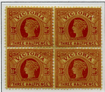
1½d Brown Red/Yellow Error – Watermark Upright

This error was first reported in “Philately from Australia” in March 1952 and listed by Stanley Gibbons in 2000.