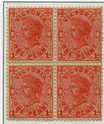
1d Pale Rose Red (Die III) Error – Watermark Sideways Facing Left

This error was first reported in “Philately from Australia” in March 1952 and listed by Stanley Gibbons in 2000.