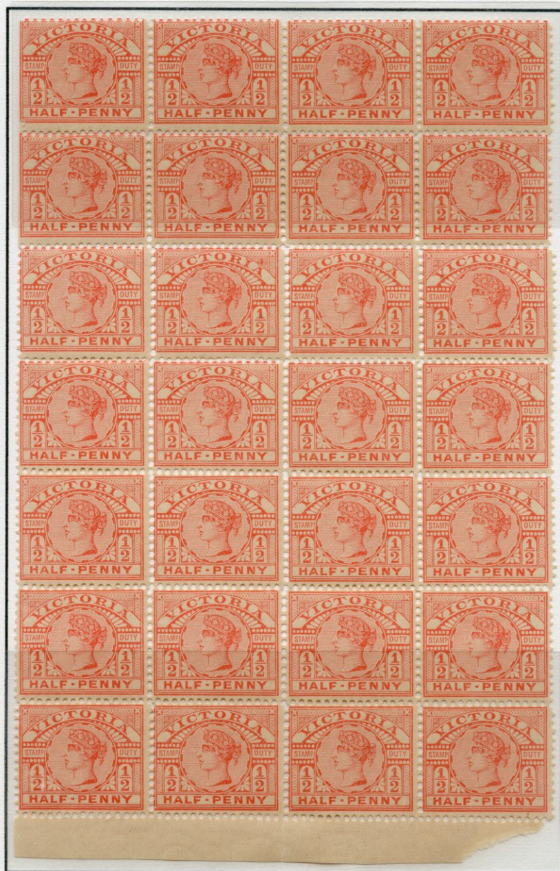
½d Deep Carmine Red Error – Watermark Upright

Victoria June 1896 Watermark V/Crown Type 3 Perforation 12½