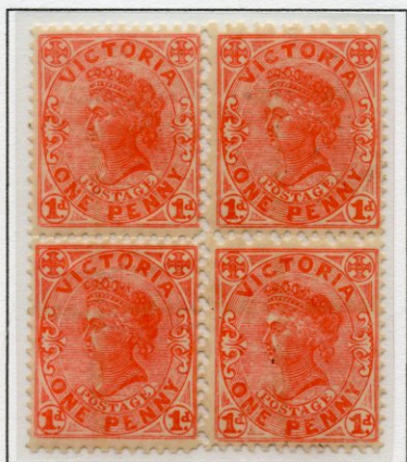
1d Rose Red

The watermark sideways error was first reported in Ewan's Weekly Stamp news in January 1910 and listed in the Stanley Gibbons catalogue in 1998.