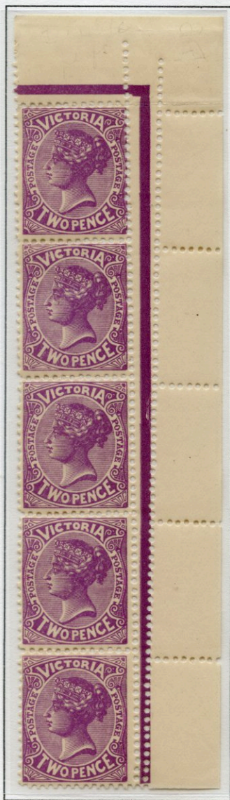
2d Reddish Violet Error – Double Perforations

Victoria July 1905 Watermark Crown/A Perforation 12 x 12½