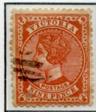
9d Dull Brown Red Error – Watermark Sideways Facing Right

There are no early reports in philatelic literature regarding this error and it was listed in the Brusden White catalogue in 2004.