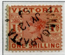
1/- Brownish Red