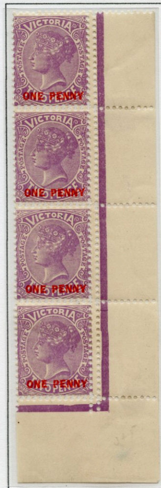
2d Reddish Violet Error – Double Perforations

29th June 1912 Watermark Crown/A Perforation 11½ x 12¼