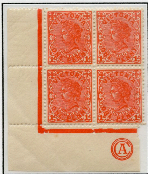
1d Rose Carmine Error – Watermark Sideways

November 1912 Watermark Crown/A Perforation 11½ x 12¼