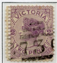
2d Violet Error – Double Perforation