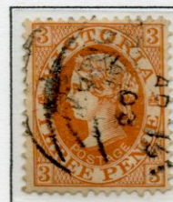
3d Dull Orange Brown Error – Watermark Sideways Facing Left

This error was first reported in “Philately from Australia” in March 1952 and listed by Stanley Gibbons in 2000.