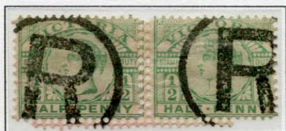
½d Emerald Error – Double Perforation