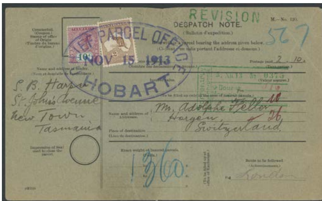
This delightful piece was one of the highlights of the auction.

One result in particular was, on the one hand professionally gratifying but, on the other, personally galling. This was the 1913 parcel form to Switzerland franked with a Two Bob Brown Kangaroo and a Tasmanian 10d Tablet (see below). I had described it as "one of only two recorded articles bearing the First Watermark 2/-, and stated to be the only recorded parcel item with a State/CofA combination franking" (and I am still waiting to find another).