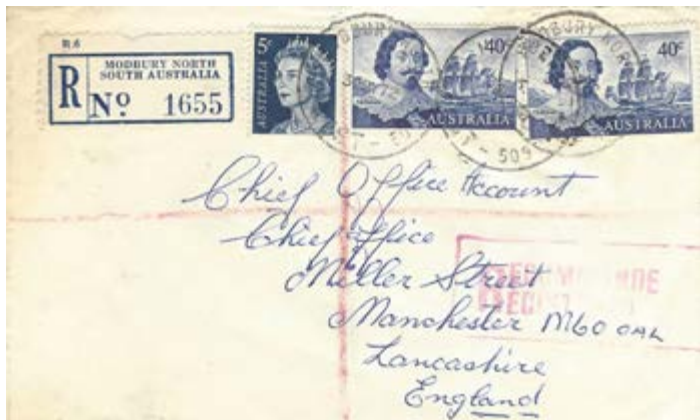
30.05.1972 Modbury North SA to England, presumably transmitted by air paying 50c registration fee and 35c airmail postage.