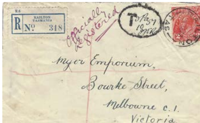
(...)06.1937 Railton Tas to Melbourne, Officially Registered being taxed at 6d (double registration fee) plus 4d (exceeding 1oz, so 2 x 2d) making a total of 10d deficiency.

“Common is not always common”, as will be obvious from a study of the tables. Short-lived registration fees after decimal currency, Listed Registered Post fees and Compensation